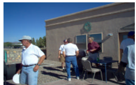
On the patio waiting turn to grill